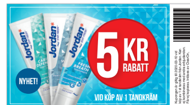
Single purchase coupon

...is a value voucher with a fixed value, e.g. SEK 50, 75 or 100. Payment vouchers are a means of payment that are not restricted to specific products; instead, the amount of the payment voucher is subtracted from the total amount of the receipt. The entire value of the coupon must be used at one time of purchase.