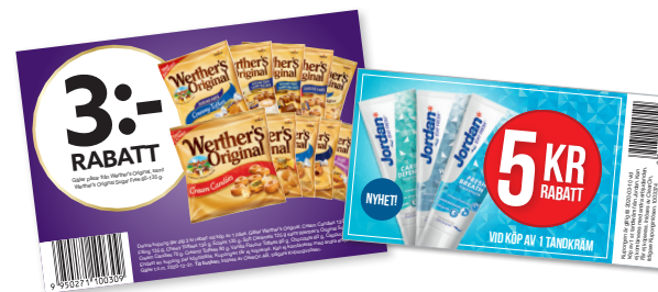
Use stark, contrasting colors.