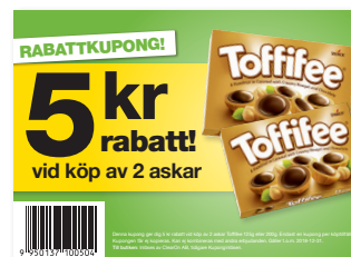
Use a larger format.