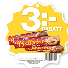
Use unusual shapes.