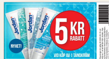
Single purchase coupon

...is a value voucher with a fixed value, e.g. SEK 50, 75 or 100. Payment vouchers are a means of payment that are not restricted to specific products; instead, the amount of the payment voucher is subtracted from the total amount of the receipt. The entire value of the coupon must be used at one time of purchase.